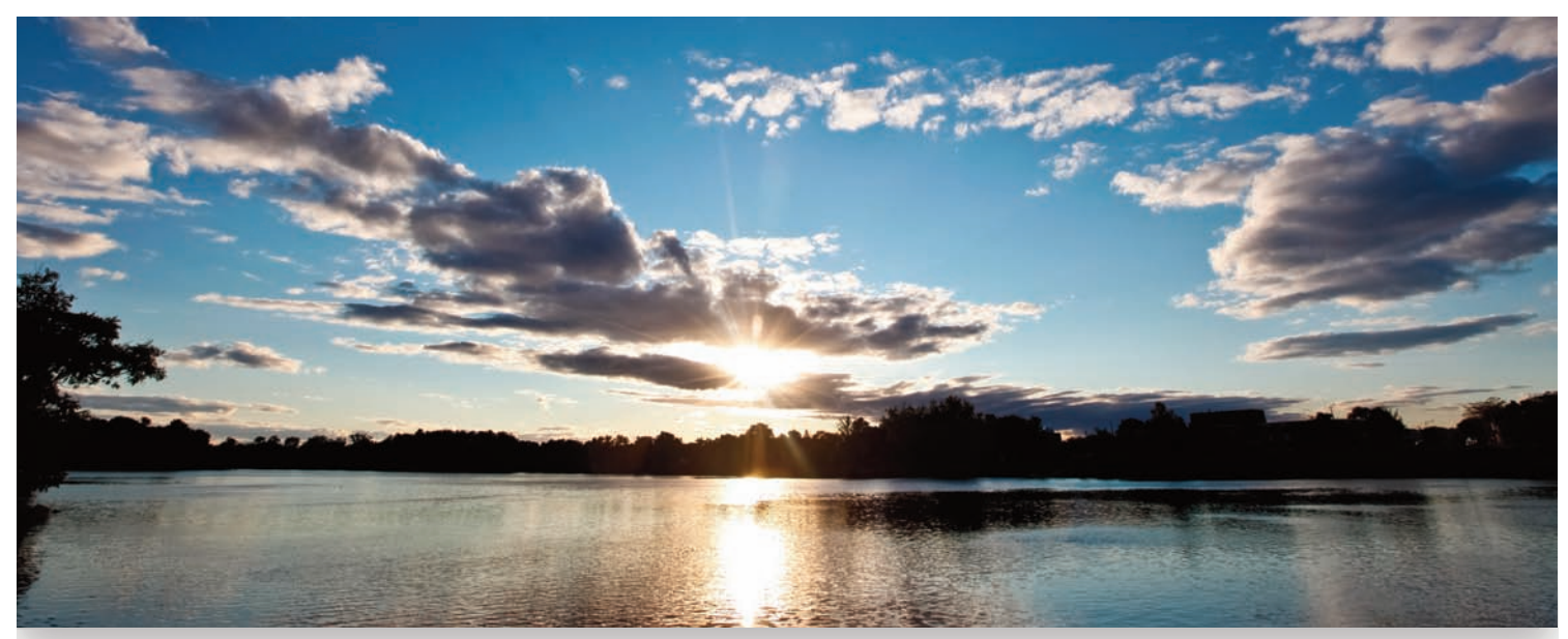
The Wisconsin River, Wisconsin Rapids, WI