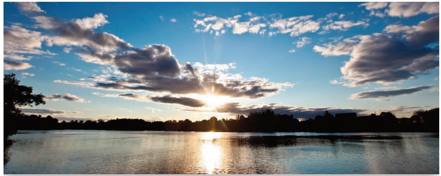
The Wisconsin River, Wisconsin Rapids, WI