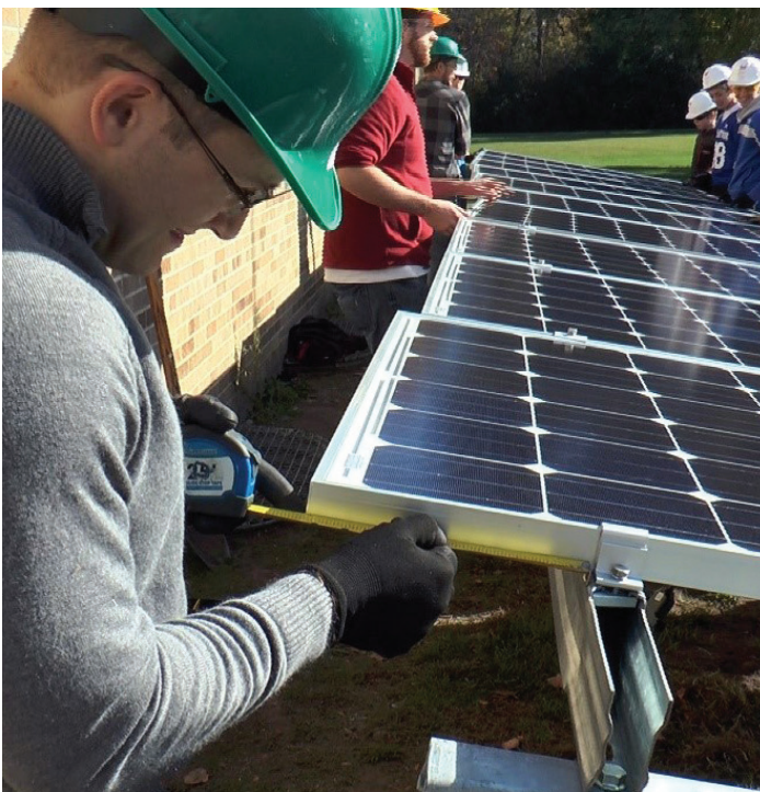
Four Constellation Energy grants at area schools educated over 1,400 students in renewable energy concepts.

Based on their highly successful collaboration, the Alliance was selected to receive four Constellation Energy to Educate grants, totaling $160,000. These grants provided solar photovoltaic installations at area schools and educated over 1,500 students in renewable energy concepts.