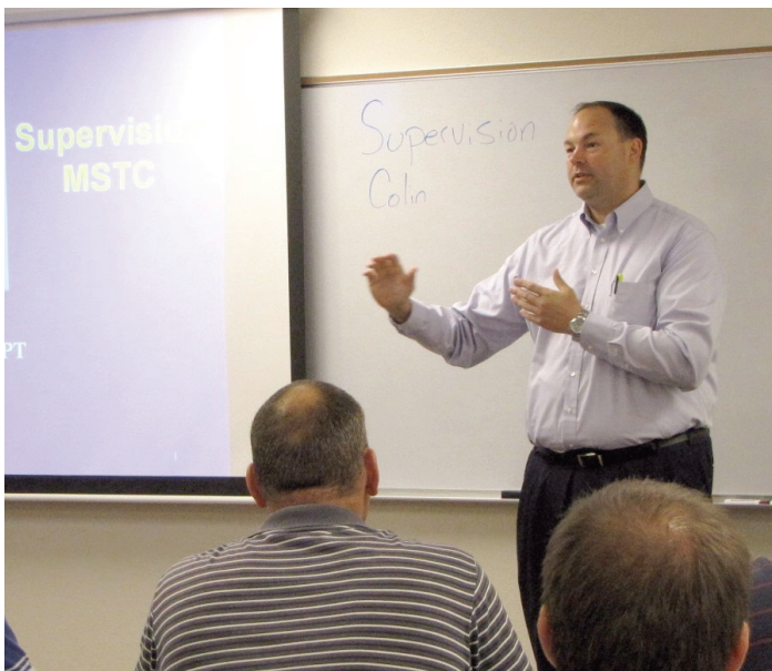
Incourage and Mid-State Technical College worked together to initiate a supervisory training program for incumbent supervisors.

Workforce Central's industry-driven approach was focused on achieving the highly skilled workforce required for businesses to grow and maintain a competitive edge in the south Wood County area. Since inception, Incourage has staffed the Partnership and facilitated collaborative relationships between businesses and K-12 schools, Mid-State Technical College and the North Central Wisconsin Workforce Development Board. This partnership develops up-to-date intelligence about the collective skills industry needs, delivers knowledge to workers, educators and policy makers, and promotes improvements in business practices and public systems that lead to healthier economies and better career opportunities for our workers and job seekers. To date, the Manufacturing Partnership has provided training and talent assessment services to 35 regional employers and over 180 local workers.