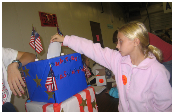
Smartvote helps future voters learn how to research topics that will make them more knowledgeable voters.

For more information on Incourage investments in Arts & Culture, see Incourage Impact: Arts & Culture.