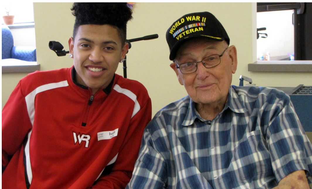
One Teen Leadership project was an intergenerational activity day with seniors and veterans at Lowell Center.