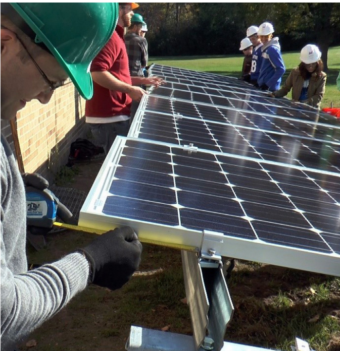
Four Constellation Energy grants have provided solar photovoltaic installations at area schools, educating students in renewable energy concepts.

To learn more about the Youth Apprenticeship Program, view this video: Are You In? Youth Apprentices.