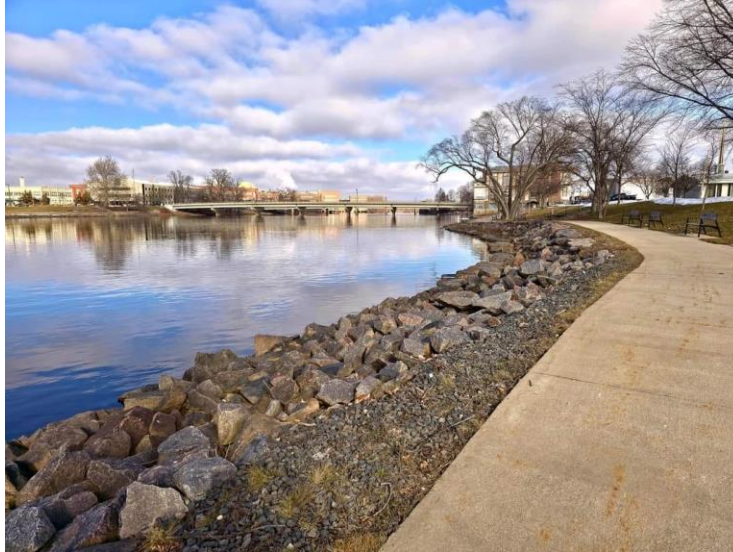
A walk along the Wisconsin River on a beautiful winter day, February 2024.

A Semi-Annual Report of Community Programs & Services You Can Support