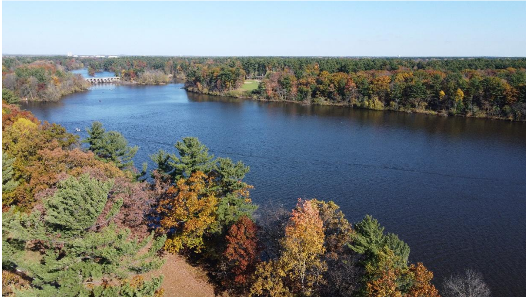
A bird's eye view of the Wis. River between Port Edwards and Wis. Rapids. Look closely – it's Bulls Eye County Club.

A Semi-Annual Report of Community Programs & Services Needing Support